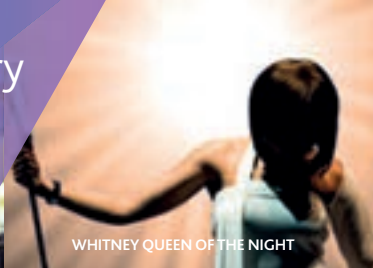
WHITNEY QUEEN OF THE NIGHT