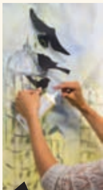
COMMUNITY ARTS CELEBRATIONS

There are three separate gallery spaces in The Riverfront: the subterranean Basement Gallery, the Art Gallery on the ground floor and the Upper Mezzanine on the first floor foyer overlooking the River Usk.