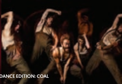
BRITISH DANCE EDITION: COAL