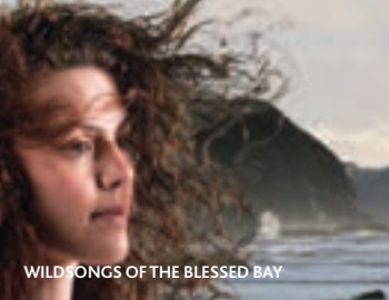
WILDSONGS OF THE BLESSED BAY