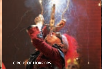
CIRCUS OF HORRORS