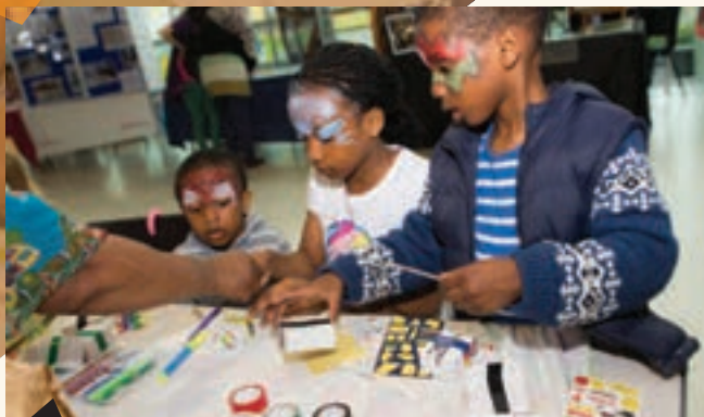
COMMUNITY ARTS CELEBRATIONS

GALLERY PROGRAMME ORIEL RHAGLEN :: 38 ::